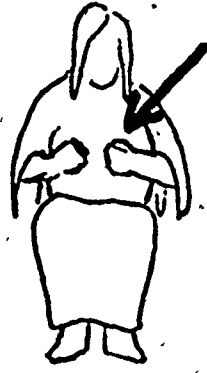
h o .n o 'ae.x -- "on both sides" (outside)