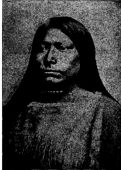
KIOWA WOMAN.

known as centering about the upper Arkansas and Canadian in Colorado and Oklahoma, and constituting, so far as present knowledge goes, a distinct linguistic stock. They are noticed in Spanish records as early, at least, as 1732. Their oldest tradition, which agrees with the concurrent testimony of the Shoshoni and Arapaho, locates them about the junction of Jefferson, Madison, and Gallatin forks, at the extreme head of Missouri r., in the neighborhood of the present Virginia City, Mont. They afterward moved down from the mountains and formed an alliance with the Crows, with whom they have since continued on friendly terms. From here they drifted southward along the base of the mountains, driven by the Cheyenne and Arapaho, with whom they finally made peace about 1840, after which they commonly acted in concert with the latter tribes. The Sioux claim to have driven them out of the Black hills, and in 1805 they were reported by Lewis and Clark as