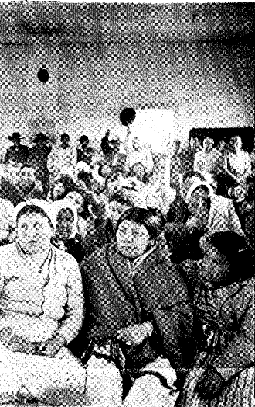
COLORADO-BORN UTES WHO LOST LANDS AND MOVED TO UTAH IN 1880