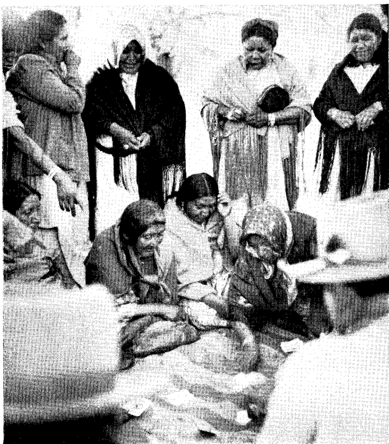
DIRTY BLANKET serves as card table for Ute squaws' monte game while other squaws kibitz. During festival, card playing went on most of the time.