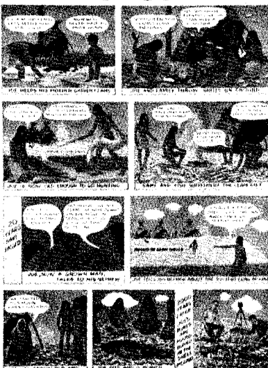
HOW A SHELL HOUND GROWS

A comic-strip technique easily explains how the clam-eating Shell Mound tribes, settled in Kentucky in 3000 B.C., came to live on hills of clamshells, discarded over the generations