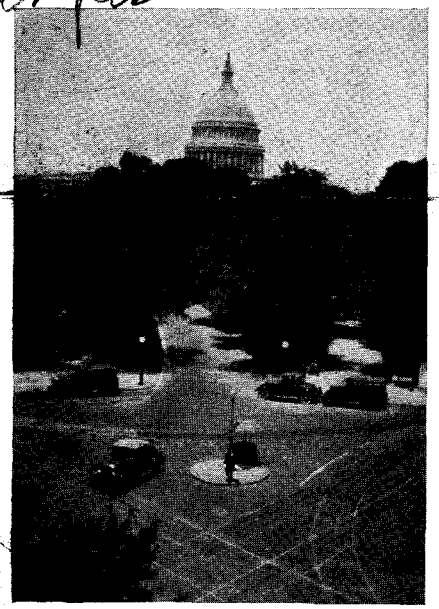
View from our roof.