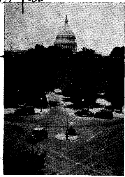
View from our roof.