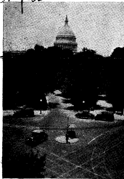
View from our roof.